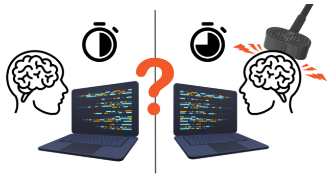
Figure 1: High-level experimental architecture: “Does impairing a brain region influence programming outcomes?”